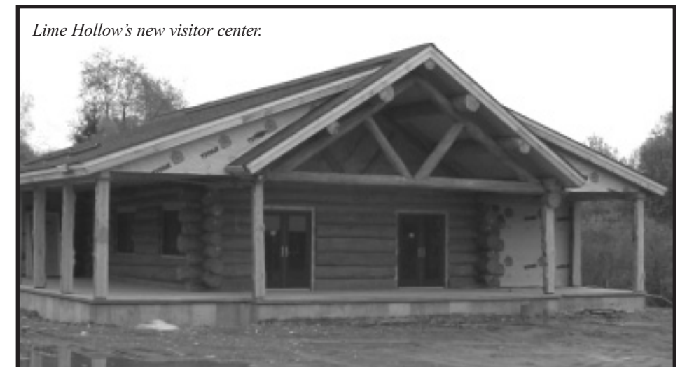
Lime Hollow's new visitor center.

Monday – Saturday: 9AM - 4PM Sunday: 1PM – 4PM LHCEC Trails: Open during daylight hours LHCEC Telephone: 607.758.5462 E-mail: limehollow@clarityconnect.com Web: http://www.limehollow.org