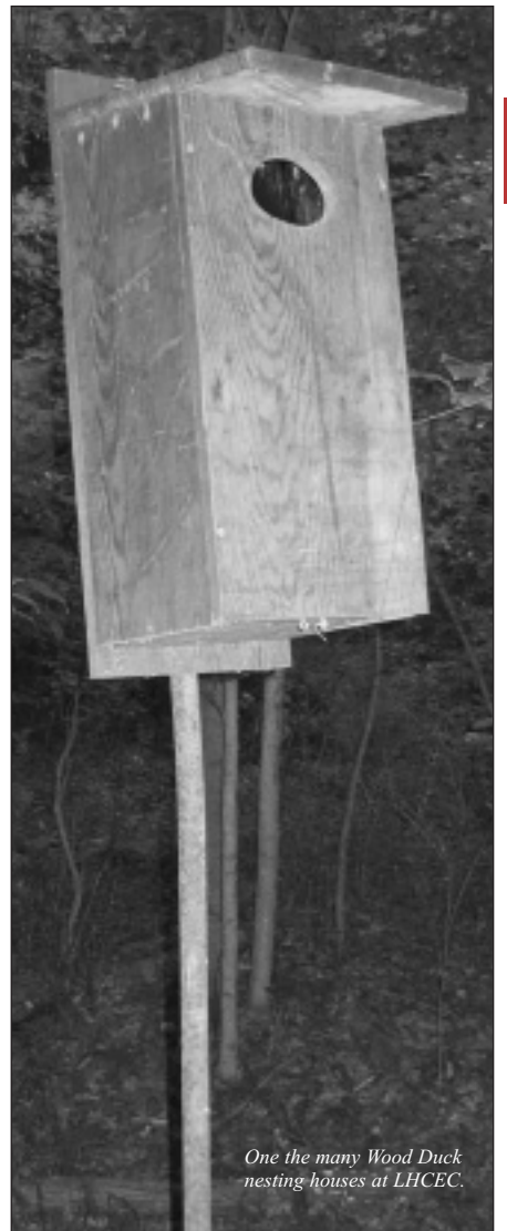
One the many Wood Duck nesting houses at LHCEC.

several locations near the LHCEC property, so hopefully providing nest boxes will entice several pairs to take up residence in the coming years. I wouldn't mind having the wood ducks for house-mates but my cat might not agree.