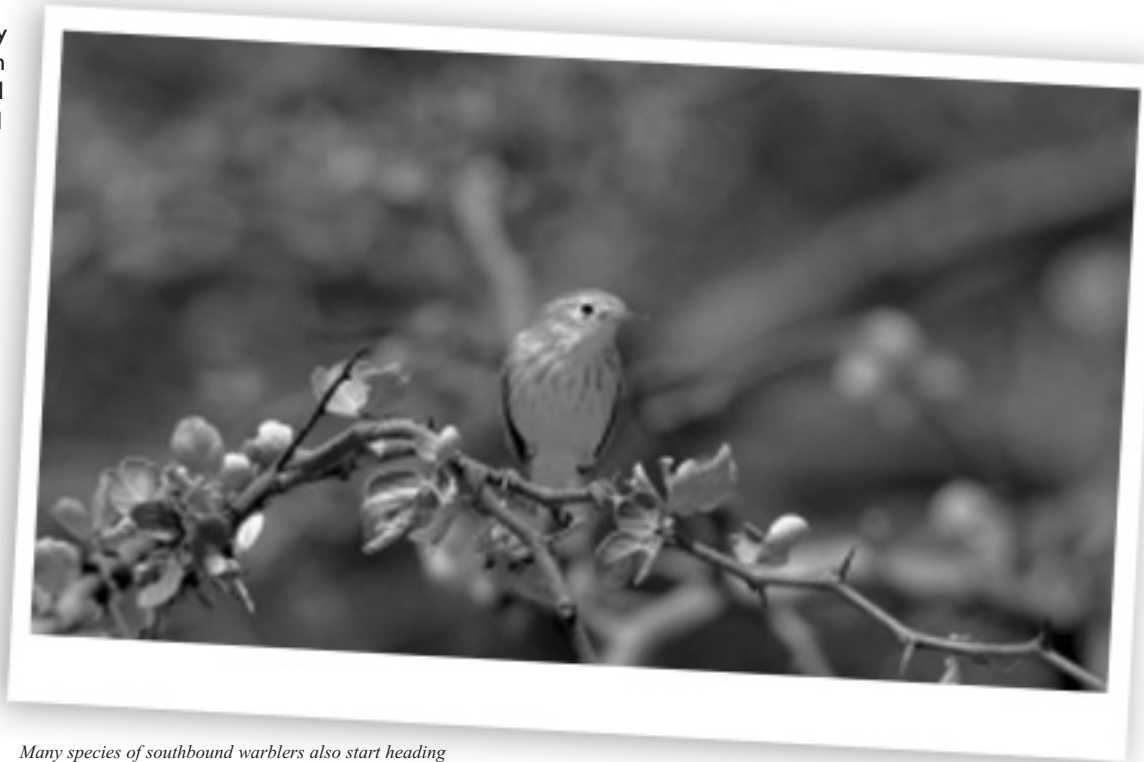
Many species of southbound warblers also start heading or their winter haunts sometime between August and October.

Unfortunately, this past spring's stalled Arctic high-pressure system blocked us from having southern winds that normally transport many migrants our way. This pattern is what meteorologist refers to as the "blocking Omega High phenomenon". This was responsible for keeping migration to a trickle. I must say that spring waterfowl and land-bird migration was the worst I've seen in the last 10 years.