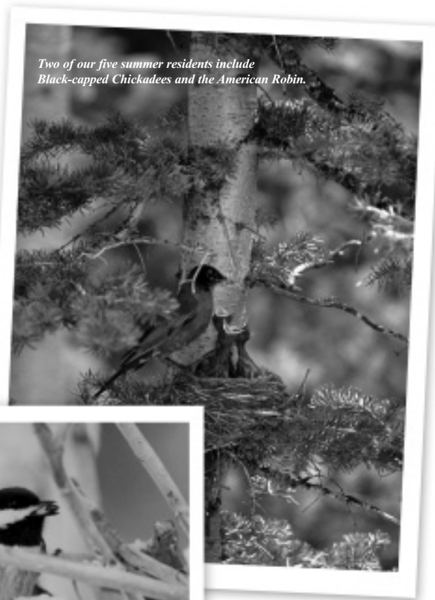
Two of our five summer residents include Black-capped Chickadees and the American Robin.